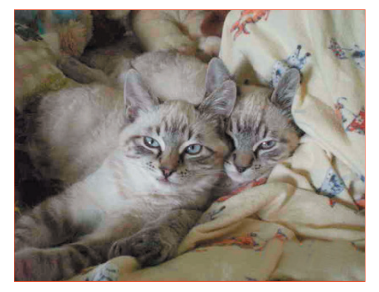
Saved First: Two part-Siamese boys have found a cushier life than seemed to be their fate when they were trapped in a gnarled tree trunk too scared to eat and easy prey for coyotes.

The individual outcomes for these lovable creatures, though, has been bittersweet: The two part-Siamese boys (pictured at right) are now completely socialized and have been adopted. And Tea, an all-black female, is doing well, though still in social transition, but I am heartbroken to report that Mittens, the beautiful black and white female and the last to be rescued, died following the spaying procedure. Everything appeared normal during the surgery, but she never woke up from the anesthesia. We found it so distressing that we decided to do a necropsy, but could find no apparent cause.